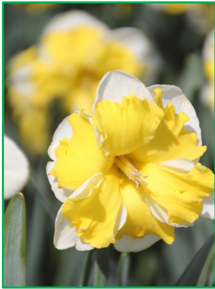
N. 'Plant America'