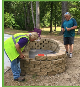
Violet Bank club members prepare to plant the memorial butterfly garden

Violet Bank Garden Club dedicated a butterfly garden at White Bank Park in Colonial Heights, VA. in May 2020. The raised bed garden was built and planted in memory of Gita Agrawal, a long-time Violet Bank member who passed in January 2020. The garden is part of the Maddie Mann Play Park for Accessible Play, completed in October 2019 and dedicated on December 7, 2019.