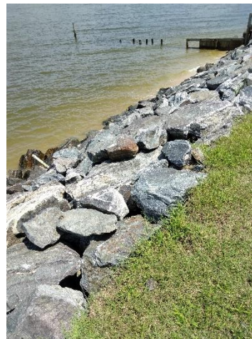
The author's property shoreline: Armor stone at the shoreline of the Potomac River with the Chesapeake Bay in the distance.

An article in the July 21, 2022 issue of the “Rappahannock Record” quoting a report from the Chesapeake Bay Program, stated in part, “Virginia reported pollution controls achieved . . . 100% of the reduction goal for sediment.” Good news!