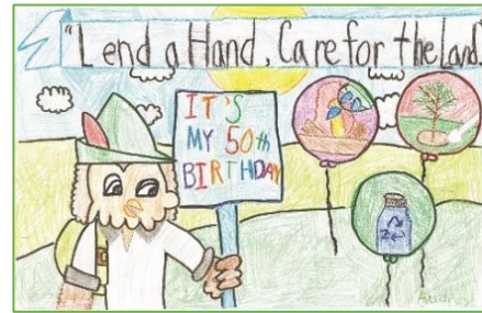
2021 Grade 1 National Winner, Salt Lake City, Utah

Piedmont District was fortunate to have two garden clubs to participate in 2021. Congratulations to Salisbury Garden Club for submitting the third-grade winning poster on the VFGC state level. The posters are first judged on the district level. Winning first through fifth grade posters are sent to the state level for judging. Garden clubs can contact elementary schools, after-school programs, daycares, and 4H programs about participation in the contest.