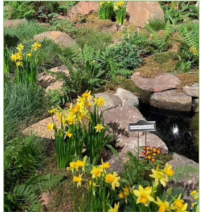
“Drift” Planting. Philadelphia Flower Show.

If your goal is to plant in a drift or grouping, it is recommended to dig and loosen the entire bed to the proper depth. Press the bulbs into the soil and cover with soil. The planting should last longer in a fully excavated bed because soil will drain better. You will also be able to admire them from afar.