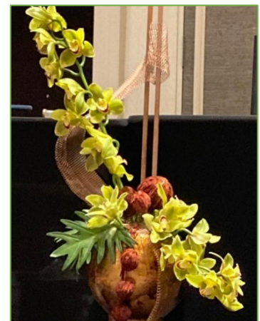
Mary's design at the 2022 VFGC Convention

Reservation Form – see page 14 of this Footprints issue or download from the website: https://piedmontdistrictvfgc.org/