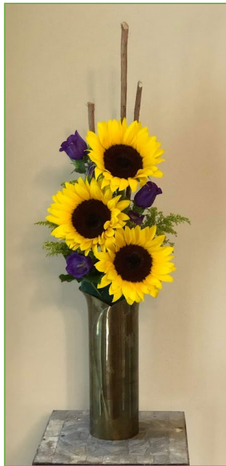
A simple floral design made with sticks for line, sunflowers for the round flower form and filler of purple Canterbury bells and goldenrod.

When choosing your plant material, color choice is also important. You will want to create color palettes that are pleasing to you. They may be different shades of a single color (monochromatic) or perhaps colors that are close together on the color wheel – for example reds, oranges, and yellows (analogous) or possibly colors that “pop” and are across from each other on the color wheel like purple and yellow (complementary). When choosing a color palette, I like to start with a bicolored or tricolored flower and then choose other flowers that will echo these colors.