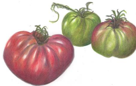
Container – grown Brandywine Tomatoes

Organic potting mixes will help your plants thrive and give you a better tasting veggie. It can either be purchased from a nursery/hardware store or you can make your own by blending equal parts of peat moss, potting soil, and vermiculite. Perlite or clean sand can be substituted for the vermiculite.