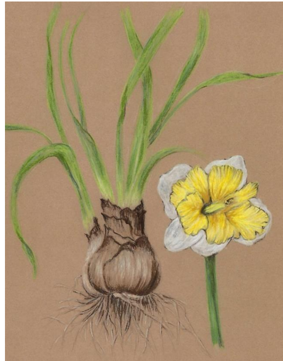
NGC's "Plant America" Daffodil Double Corona Cultivar

For lo, the winter is past, the rain is over and gone, The flowers appear on the earth, The time of the singing of birds is come, And the voice of the turtle(dove) is heard in our land.