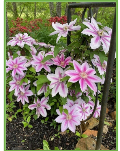
Clematis 'Nelly Moser'