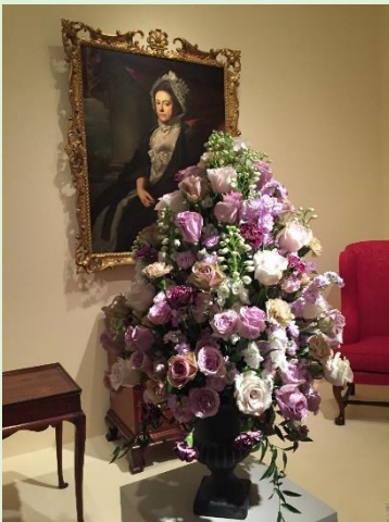
Sally's interpretative design at VMFA's Fine Arts & Flowers 2018