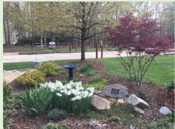
‘Daffodil Delight’ at the Anniversary Garden, Christ of the Redeemer Church -Salisbury Garden Club’s meeting place

Heavenly Father, give me the wisdom to know what I need to for this season of my life. Guide me in all that I do. That I might bring honor and glory to you. Amen