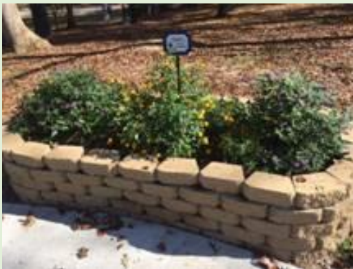
Violet Bank Garden Club's project at White Bank Gardens

We did not have any applications for Piedmont District Grants this year, most likely due to the pandemic. However, we are pleased to report that Violet Bank Garden Club, one of the recipients of last year's grants, was able to complete the landscaping for their project at White Bank Park in Colonial Heights. See the beautiful bed with the plants all grown.