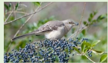
Photo: A mockingbird eating Chinese Privet berries. by Bob Schamerhorn, www.iphotobirds.com

Invasive plants are almost impossible to eradicate once they become established. As responsible homeowners and gardeners, it is important to be mindful when landscaping your property, and to select native plants instead of destructive, invasive thugs. The decisions we make today will impact the land around us for generations to come.