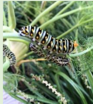
Munching on Fennel

After hatching from egg to larvae stage, caterpillars begin eating the host plant. At this stage, they are vulnerable to several predators such as birds, praying mantises, and reptiles. To protect them, I cover the plant with tulle netting. The caterpillars crawl out from under the netting when they are ready to pupate.