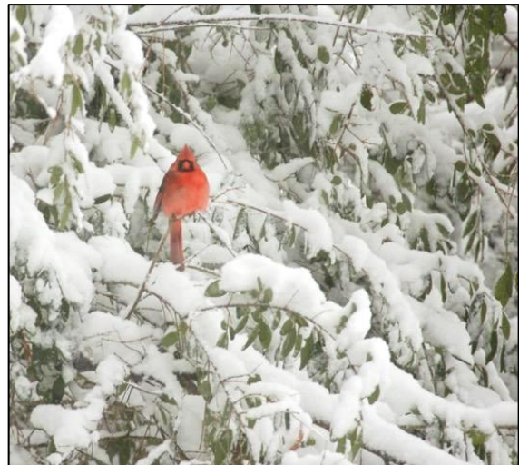
Cardinal in the Snow

Include: club name, deceased member's name, year of passing, and whether she served as president and/or was a charter member.