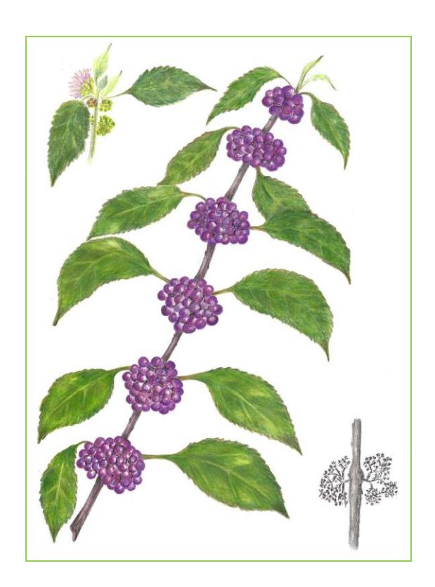
Callicarpa, American Beautyberry

BHG is part of the Meredith Home Group. © Copyright 2019, Meredith Corporation. All Rights Reserved