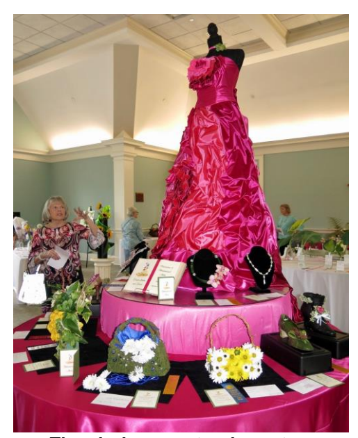
The glorious centerpiece at Salisbury GC's flower show