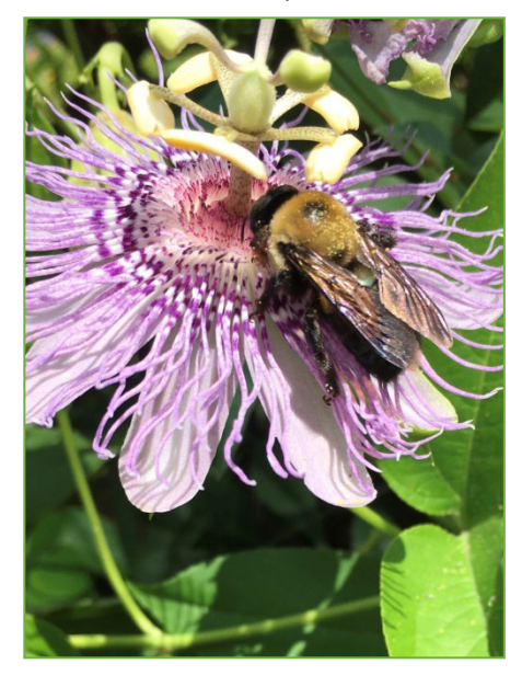
Carpenter Bee and Passionflower in my back yard

Pollination is the transfer of pollen from the male parts of a flower to the female parts of a flower of the same species, which results in fertilization of plant ovaries and the production of fruit and seeds. The main insect pollinators, by far, are bees. European honeybees are the best-known pollinators. But there are also hundreds of other species of bees, mostly solitary ground nesting species that are essential pollinators.