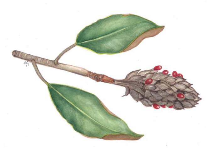
Magnolia grandiflora

If you have any questions, contact me at dougandjoanne@gmail.com.