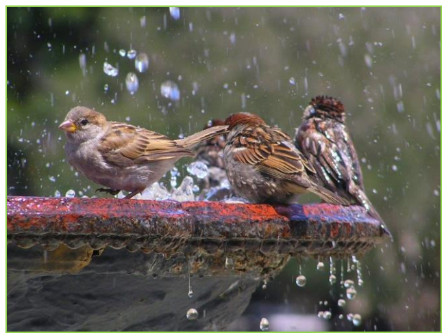
Sparrows playing in the water. .